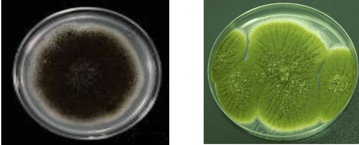
Figure.2 Anti-fungal activity of the cell extract of Spirulina platensis against the two fungal strains