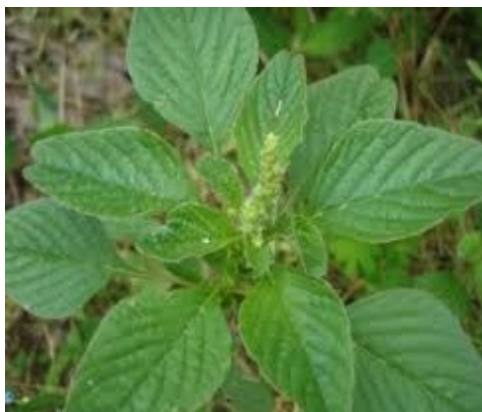
Fig.1 Amaranthus dubius