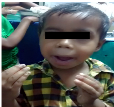
Figure.2 Girl Sibling Showing Oral Thrush and Nail Dystrophy