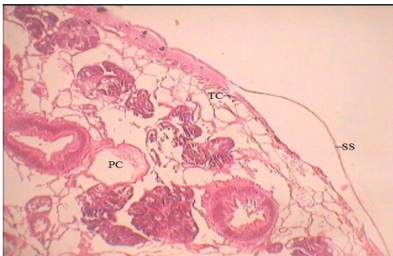
Fig.3 Photomicrography exhibiting rupture of parenchymatous cell (PC), tegumental cells (TC) and surface syncytium (SS) of treated Gastrothylax crumenifer x 110.