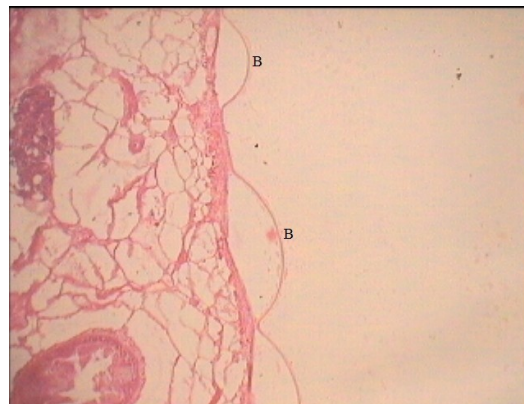
Fig.5 Blebbing (B) of tegument showing in treated Gastrothylax crumenifer x 110