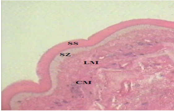
Fig.1 A portion of tegument of control Gastrothylax crumenifer showing surface syncytium (SS), subsyncytial zone (SZ), longitudinal muscles (LM) and circular muscles (CM) x 185..