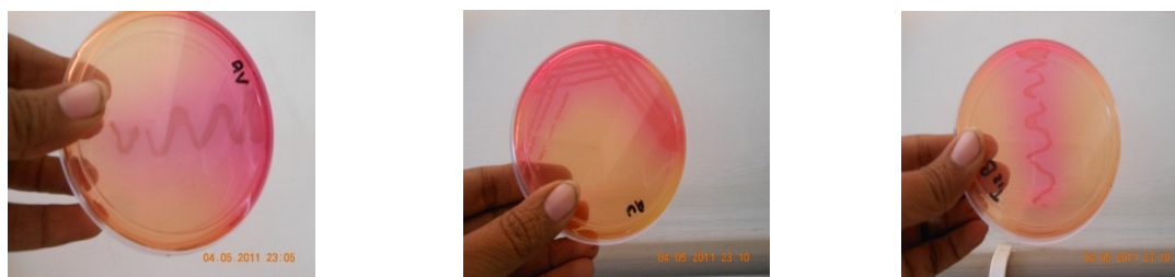
Fig. 2. Plates showing production of L-asparaginase by microorganisms