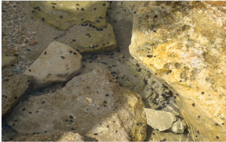
Fig.4 Population structure of Melanopsis buccinoidea , Ain Al-Tamur 23.2.2013.