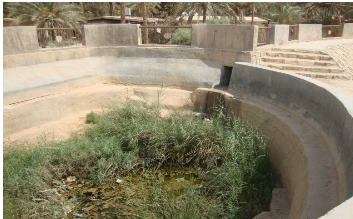
Fig.2 Recently drilled artesian well in Ain Al-Tamur.