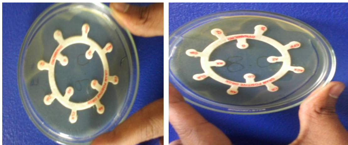
Figure.3 Antibiotic sensitivity test for the isolated Bacillus sp and Aeribacillus sp