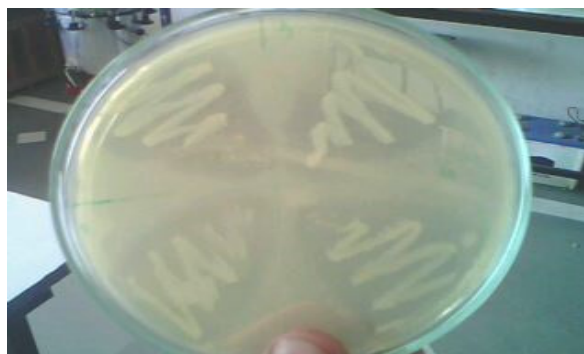
Figure.1 Screening of lipase producing thermophilic bacteria at 50°C, clear zone indicates the hydrolysis of tributyrin as a result of lipase production

The Bacillus sp. showed resistance towards antibiotic cefotaxime and cefadroxil whereas Aeribacillus sp. showed resistance towards antibiotic Cefotaxime and cefuroxime.