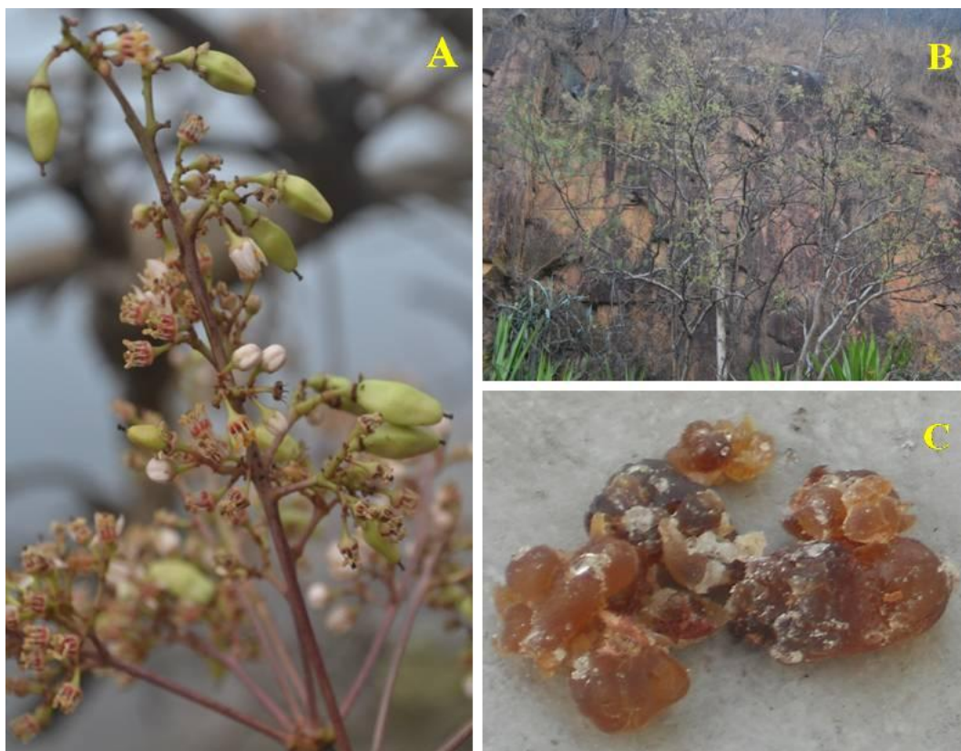
Fig.1 A. Flowering and Fruiting of Boswellia serrata B. Tree Habitat C. Crude Frankincense resin