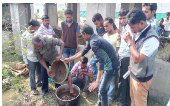
1. Preparing raw Material for Vermicomposting