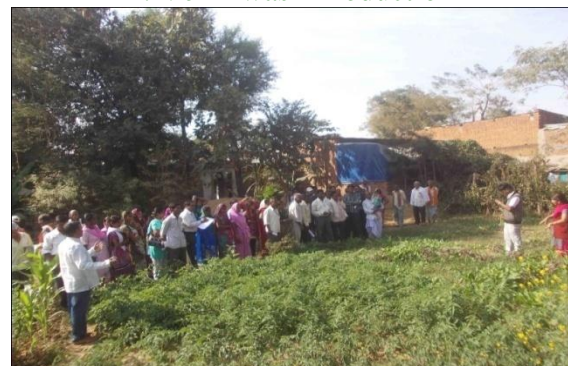
6. Organic Formers Field Visit at Baheradih