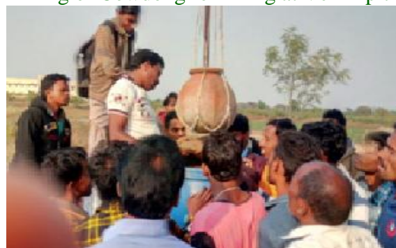
4. Vermiwash Production