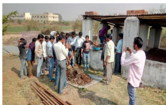
2. Mixing of Cowdung for Filing at Vermi pit