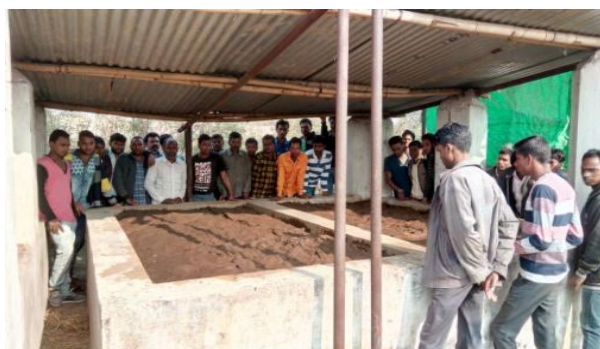
3. Filling of raw material at pit