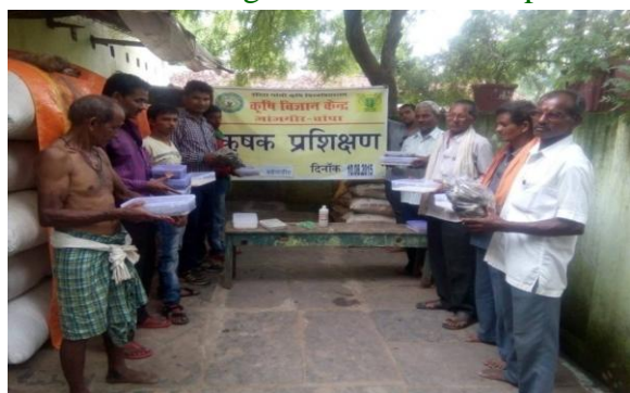
5. Trichodrema based Vermicomposting