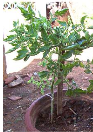
Fig.1 Induction of defense enzyme (Peroxidase) in tomato genotypes