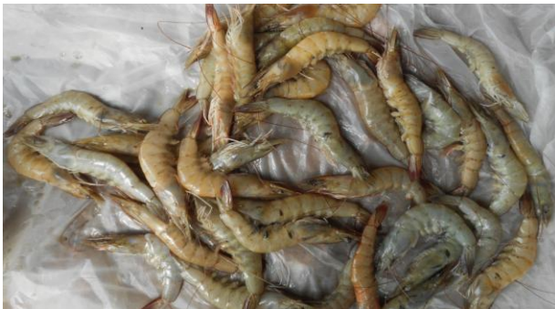
Fig.6 White gut / faeces syndrome