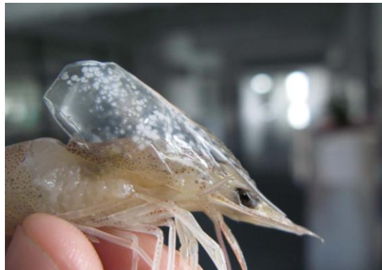
Fig.2 L. vannamei effected with growth retrodation and there by showing wide range of size variation due to Hepatopancreatic microsporidiosis