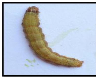
4 th instar larvae