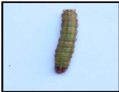
3 rd instar larvae