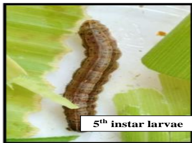
5 th instar larvae