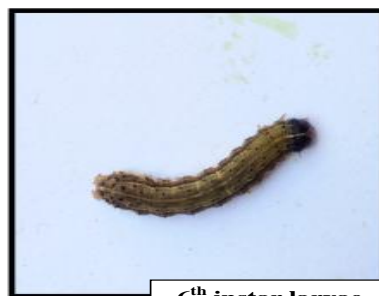
6 th instar larvae