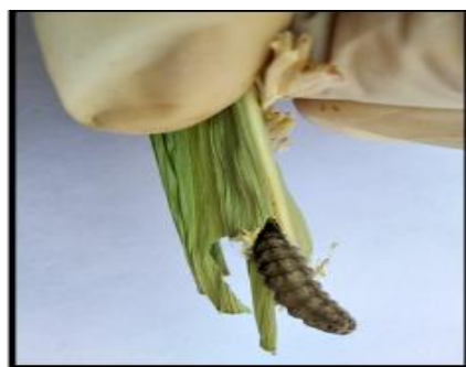
Pre- pupal stage