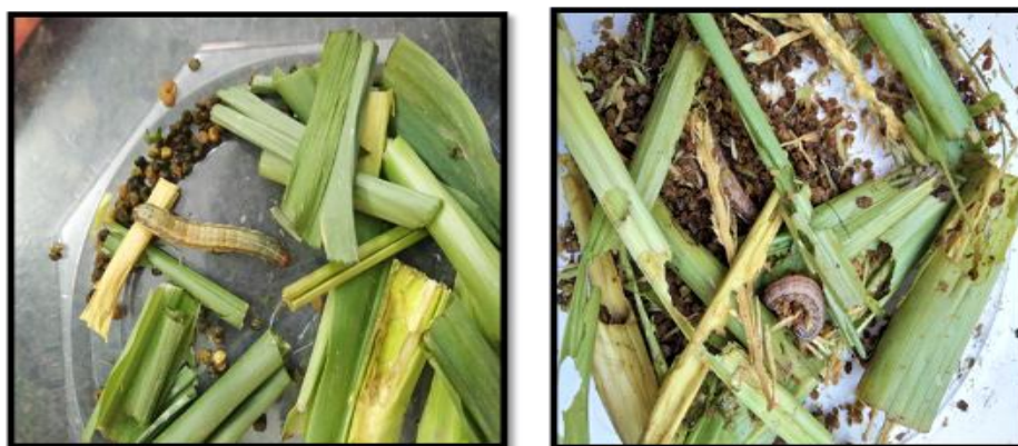
Fig.2 Different life stages of fall army worm, Spodoptera frugiperda