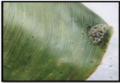
1 st instar larvae