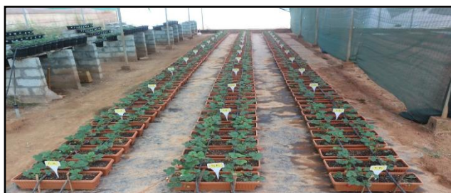
Fig.2 Influence of chitosan foliar application on fruit quality of strawberry