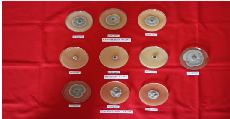
Fig.2 In vitro evaluation of systemic fungicides against Alternaria solani