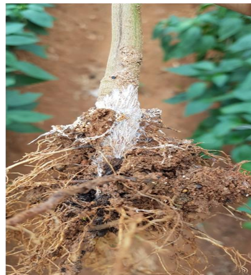
(b) Mat like mycelia growth at collar region

In Kolar taluk, the disease incidence ranged from 01.00 to 06.00 per cent. The highest incidence of 06.00 per cent was recorded in Harati village and least disease incidence of 01.00 per cent in Nayakanahalli village. The disease incidence in Malur taluk ranged from