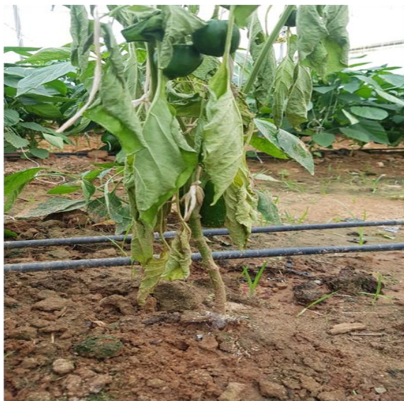
(a) White sclerotial growth at collar region