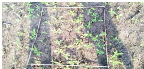
Broadcast: Live seed rate 2.25 kg ha -1 + dead seed @ 3.75 kg ha -1 . Irrigated sowing and Pretilachlor 50EC @ 0.9 l ha -1 at 48 hr. after sowing. Population at 20 DAS 5.2 l ha -1