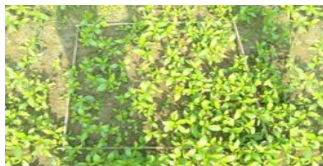
Broadcast: Live seed rate @6 kg ha -1 . Irrigated sowing and Pretilachlor 50EC @ 0.9 l ha -1 at 48 hr. after sowing. Population at 20 DAS 12.6 l ha -1