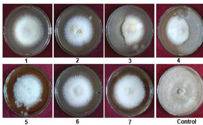
Fig.1 Bioefficacy of different oil cake extracts on the growth of M. phaseolina in vitro at 10 % concentration