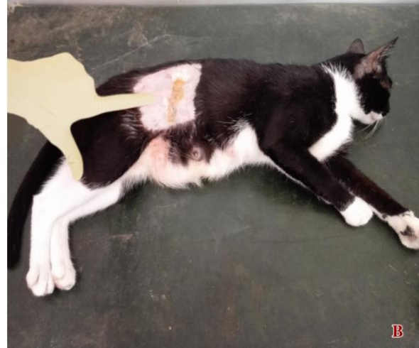
Fig.1 Behavioural changes at one hour postoperatively Glasgow CMPS - F