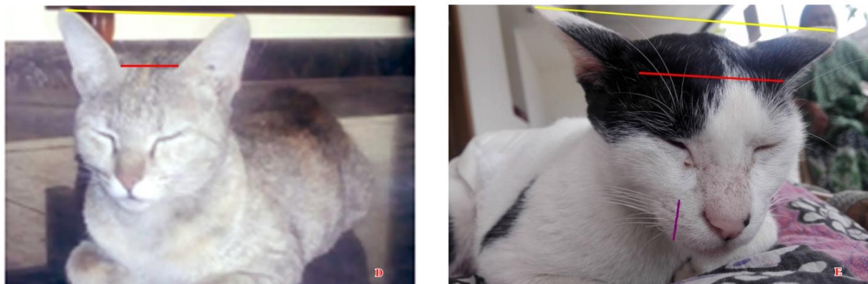
Fig.2 Behavioural changes at five hour postoperatively Glasgow CMPS - F A) and B) Hunched posture and arched back indicative of pain C) Facial expression indicative of painful reaction to surgical wound palpation D) and E) Distance between the slope of the line joining the base of the ear and tip of the ear Painful cat demonstrating squinted eyes, flattened ears and pulled back whiskers