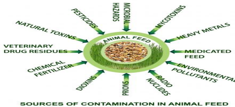
Fig.2 Safe animal feed to safeguard human health