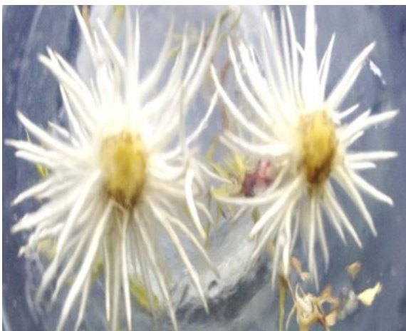
1.0 NAA media