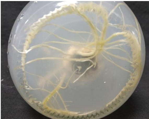
0.5 IBA media (Best treatment)