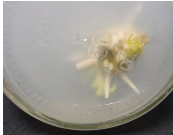
1.0 NAA + 1.0 IBA media