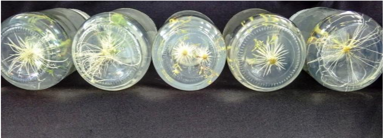
0.5 IBA, 1.0 IBA, 0.5 NAA, 1.0 NAA and Control from left to right