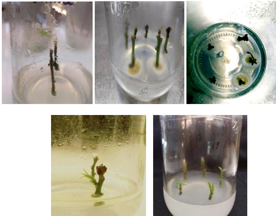
Fig.2 A. Browning and dying of explants due to longer exposure. B&C. Fungal contamination observed after 2 weeks of culture. D&E. Well established explants