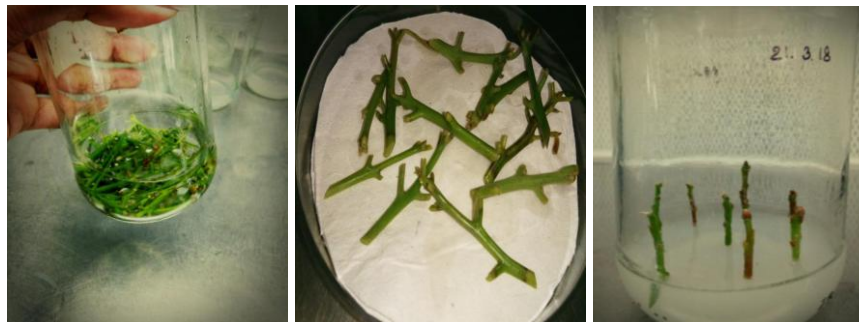
Fig.1 A. Surface sterilization of explants with 0.1% HgCl 2 , B. Blot drying of explants before inoculation