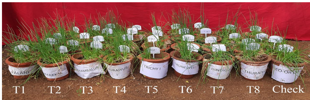
Figure.2 Screening of onion genotypes against Fusarium oxysporum f. sp. cepae under in vivo