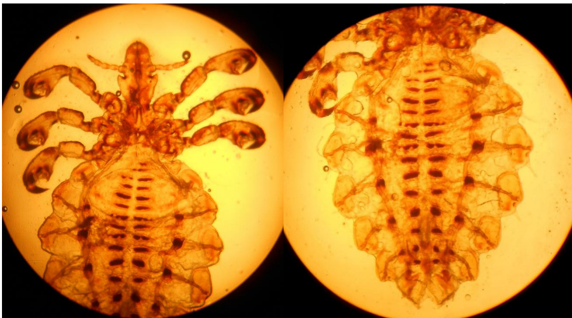
Fig.2 Magnified view (10x) of Adult sucking louse ( Haematopinus tuberculatus )

A Cheek (5×10 cm); B Ear (5×10 cm); C Neck and dewlap (10X20 cm); D Withers(10X10 cm); E Foreleg (10X10 cm); F back(10X10 cm); G Hind leg (10X10 cm); H Tail head and perineum (10X10 cm)