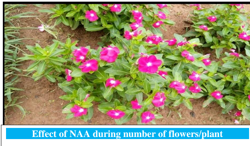
Fig.4 The effect of plant growth regulators on the flowering and yield parameters of Vinca rosea