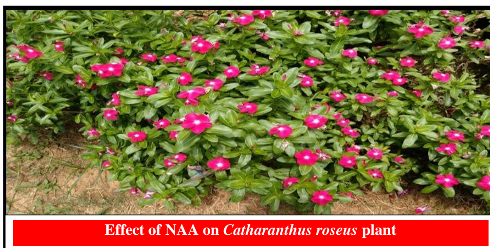
Fig.2 The effect of plant growth regulators on the vegetative growth parameters of Vinca rosea