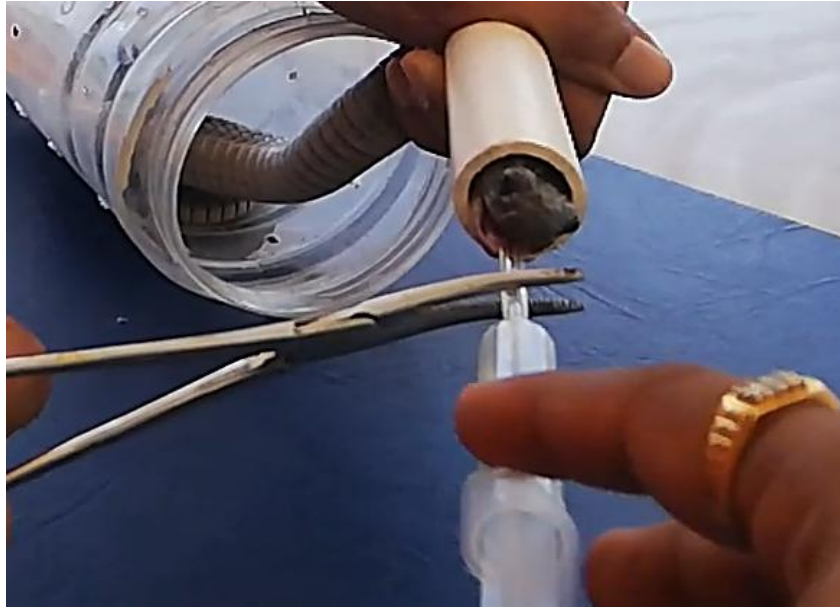
Fig.2 Oral administration of a preparation containing vitamins after proper physical restraint