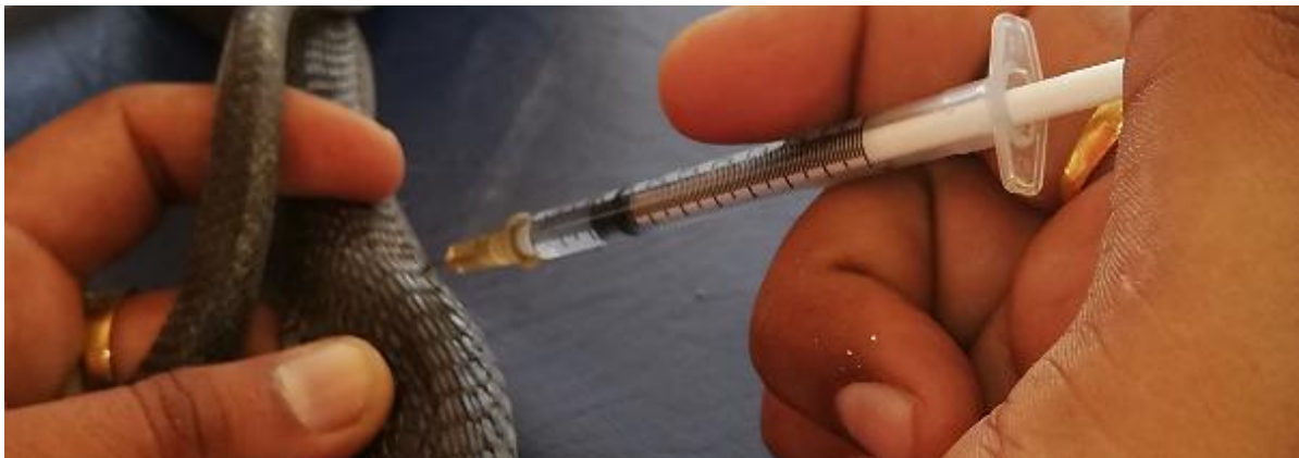
Fig.3 Intramuscular injection of atropine sulfate