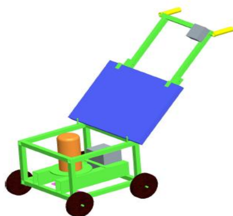
Fig.1 3D model of lawn mower