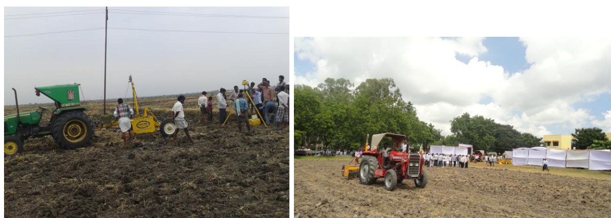
Fig.2 Trainings and demonstrations of Laser land levelling technology

After encouraged by the beneficial impacts of this Laser levelling technology in different states of the Northern India the number of Laser levellers increased more than 13000 but in Karnataka these are still less than 50