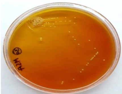
Figure.5 Staphylococcus showing golden pigmentation on MSA