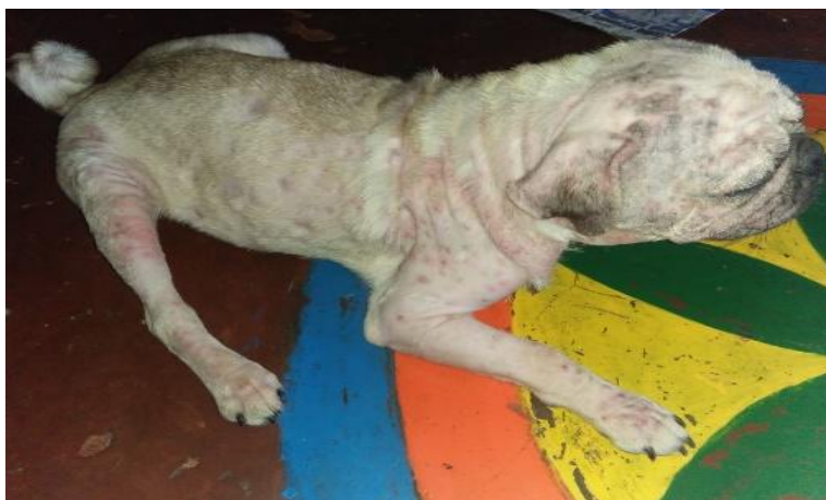
Figure.7 After one and half month of therapy