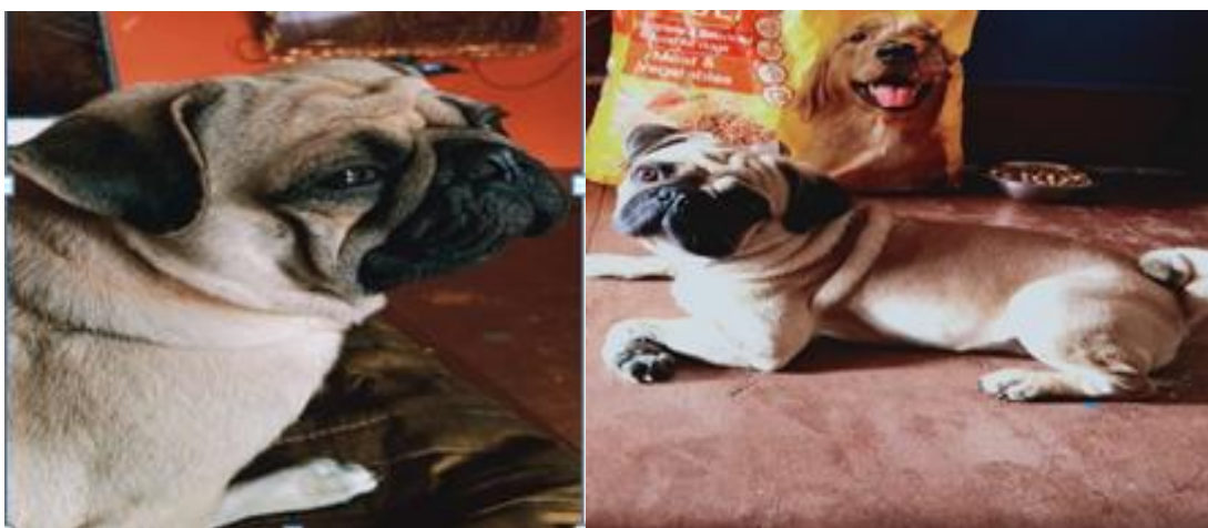
Figure.8&9 Recovered dog after two months of therapy

With the present case, it can be concluded that the cases of demodicosis if not treated in time can become complicated with secondary bacteria leading to pyoderma and such cases can effectively managed with administration of ivermectin, and antibiotics along with supportive therapy with antihistamines, anti-inflammatory drugs, hypoallergenic prescription diet and bathing with benzoyl peroxide containing shampoo.