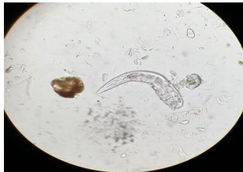
Figure.4 Demodex canis in skin scrapings under microscope