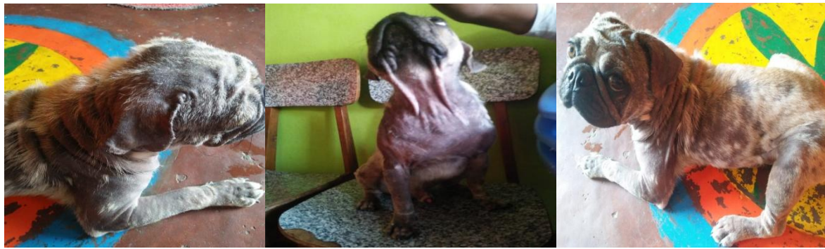
Fig.1,2&3 Erythema and alopecia on face, around the eyes and ears; Chin region, fore limbs, neck and ventral abdomen; Hind limbs and lateral abdominal areas

shampoo Sulbenzpet, recommended for the present case containing Benzoyl Peroxide is a good keratolytic agent and has strong follicular flushing action which assists in clearance of mites from skin of dogs (Satish Kumar et al. , 2017).