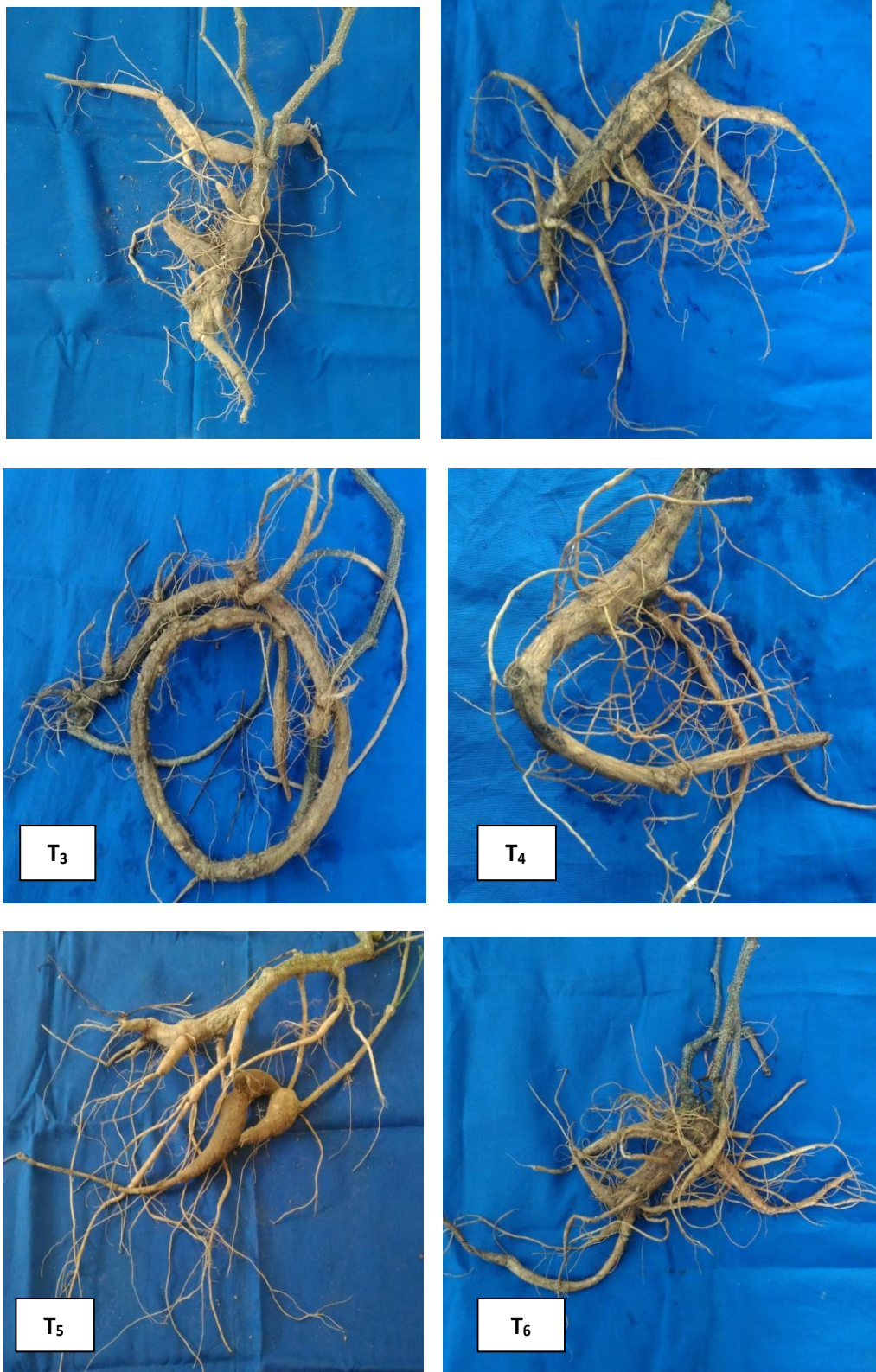
Figure.2 Effect of Glomus fasciculatum , Org-Trichojal, vermicompost and carbofuran 3G on root growth of Ivy gourd