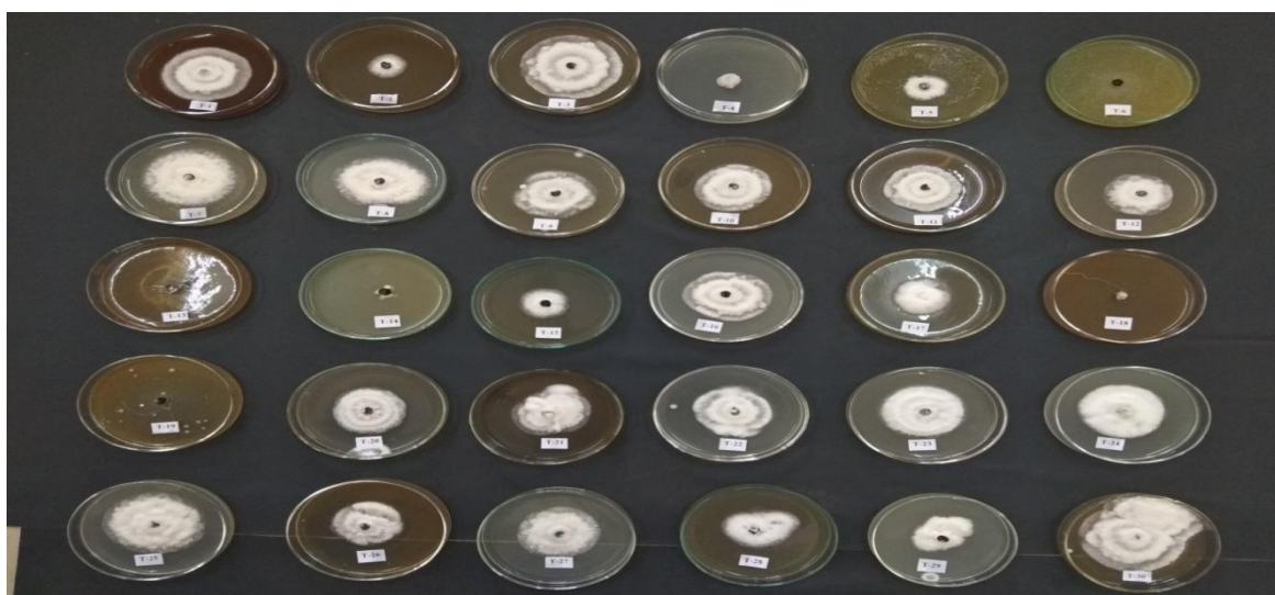
Fig.3 Effect of different plant leaf extract on P. palmarum