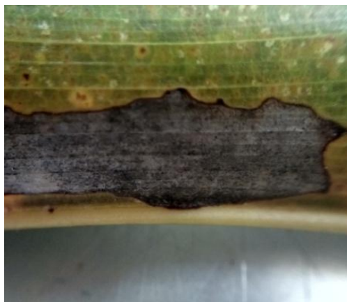
Fig.2 Infected coconut leaf