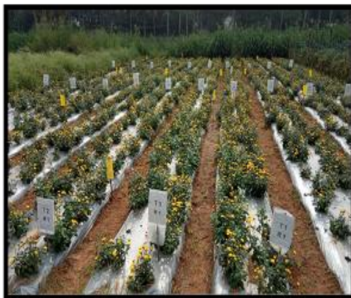
Fig.1 Chrysanthemum at flowering stage

Note: AMC- Arka Microbial Consortium (IIHR); DAT- Days after Transplanting; FYM - Farm Yard Manure (25 t/ha.); MC - Microbial Consortium (UASB); POP- Package of Practice; RDF- Recommended Dose of Fertilizer (100:150:100 kg /ha N: P: K); VC- Vermicompost-7.5 t/ha