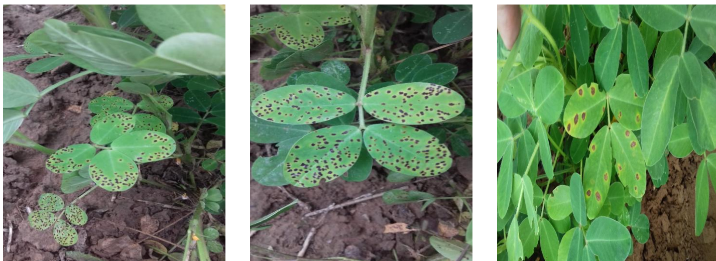
Fig.1 Early leaf spot symptoms on leaves