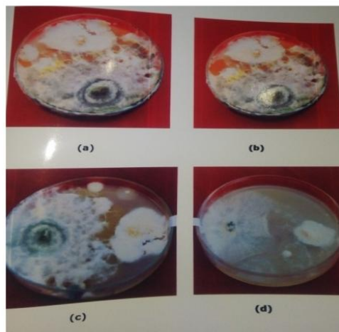
Plate.3 Mycelial interaction by dual culture method