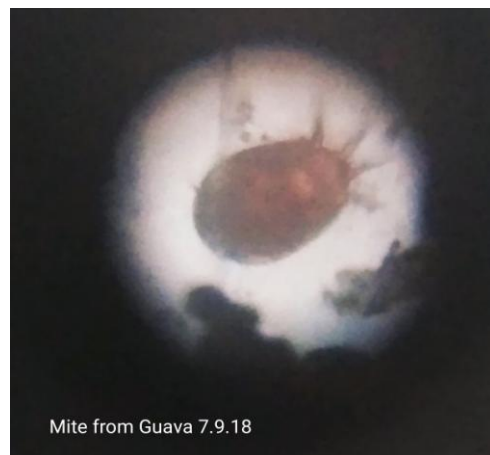
Fig.6 Mite from guava samples.