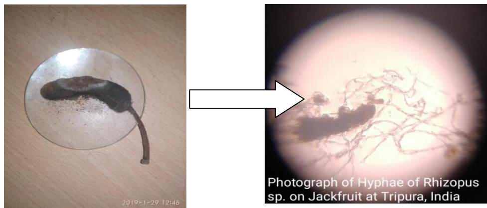
Fig.7 Rhizopus sp. from Jackfruit viewed through foldscope