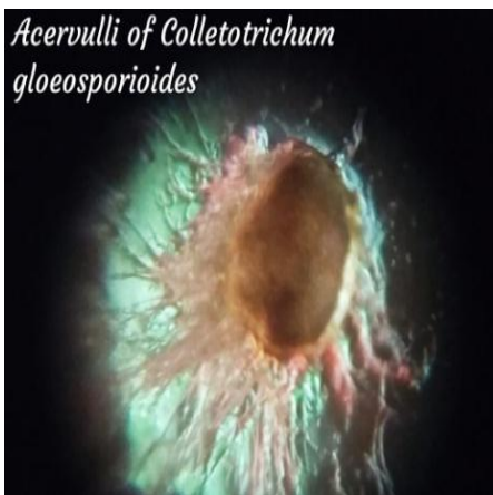
Fig.3 Acervulus of C. gloeosporioides Penz.