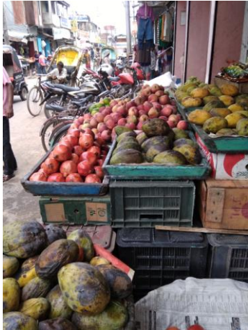
Fig.1 Postharvest rot on fruits observed at markets of Gomati District, Tripura, India