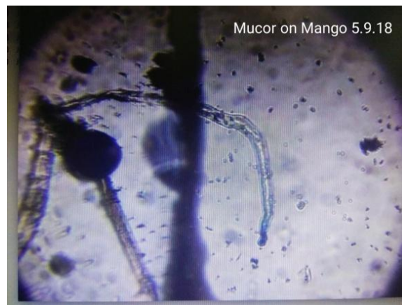
Fig.4 Sporangiophores, sporangium and spores of Mucor sp.