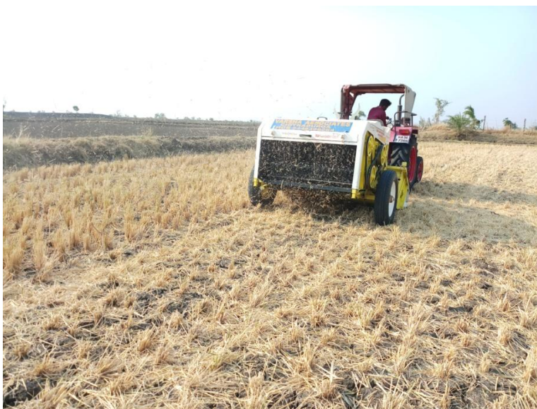
Fig.1 A view of field performance evaluation of straw chopper cum spreader for paddy

An experiment of randomized block design was used to conduct the experiment and test the significance of variables and their interactions.