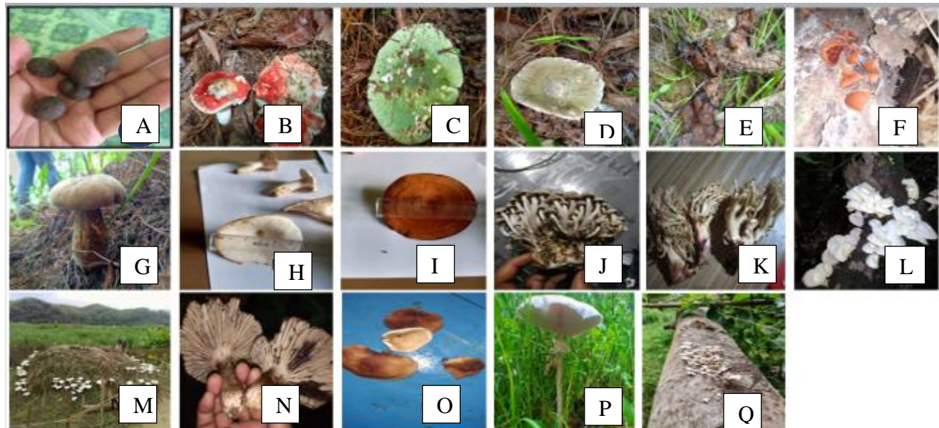
Photoplate 1: a) Elaphomyces anthracinus b) Russula subfragilliformis c) Russula virescens d) Russula cyanothoxa e) Exidia recisa f) Auricularia auricula-judae g) Boletus quercicola h) Lactarius piperatus i) Lactifluus corrugis j) Hypsizygus tessellatus k) Ramaria sp. l) Lentinus tigrinus m) Termitomyces heimii n) Russula nigricans o) Lentinula lateria p) Macrolepiota dolichaula q) Schizophyllum commune .