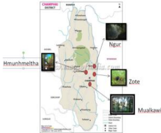
Plate.2 Map of Champhai District showing the study area