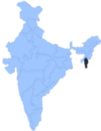
Plate.1 India map highlighting Mizoram State

reddish brown covered with scales when mature. Spore print white to cream. Saprobic, growing alone, scatter on tree branch, stump mostly chesnut tree.