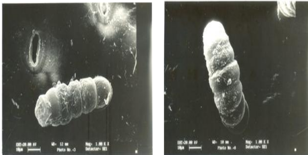
Plate2. Scanning electron micrograph of globular glandular trichomes on sunflower leaves under two levels of nitrogen