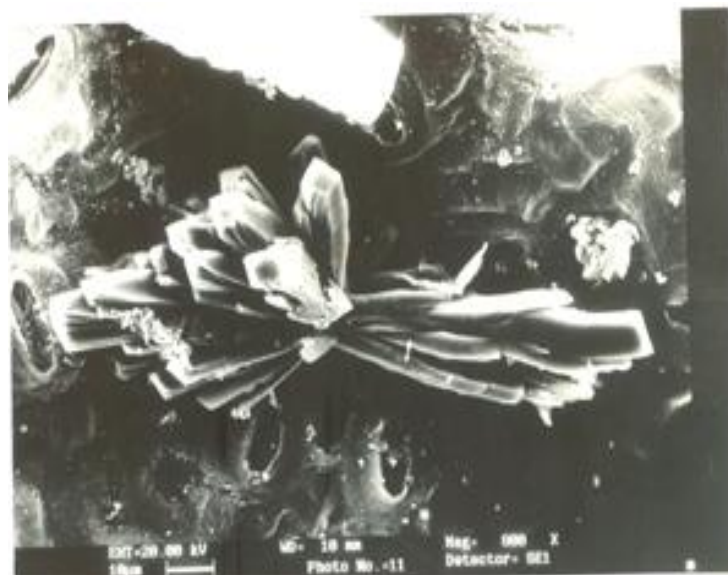
Plate1A.Wax crystals (p-Menthanol) on leaf surface of sunflower