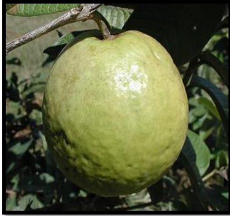
Pale yellowish green