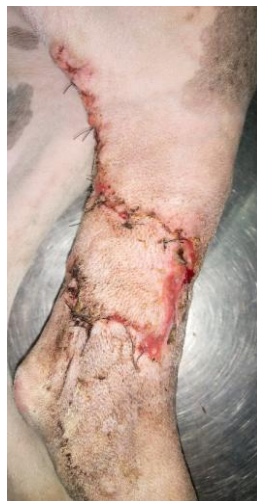
Fig.3 Transpositional skin flap with complete flap uptake