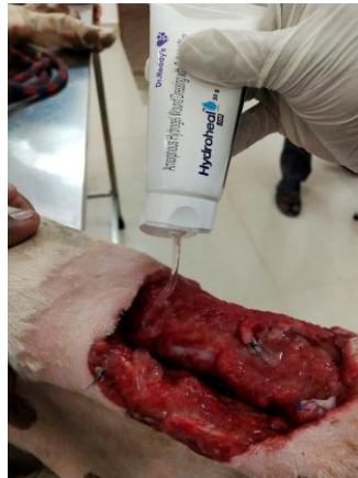
Fig.2 Application of hydroheal for wound