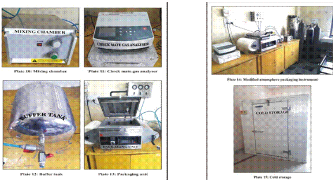
Plate.1 Mixing Chamber, Check mate gas analyser, Buffer TankPackaging, Packaging unit, Method atmosphere packaging instrument and Cold storage