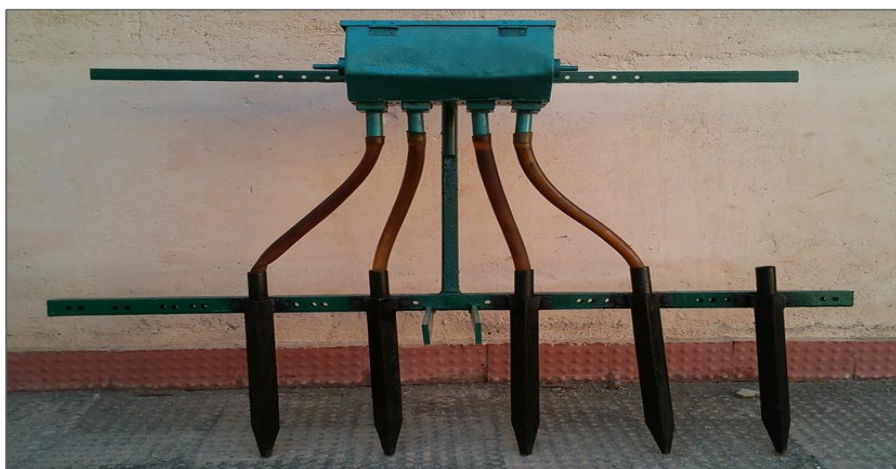
Fig.4 Developed modified bhoramdev animal drawn seed drill