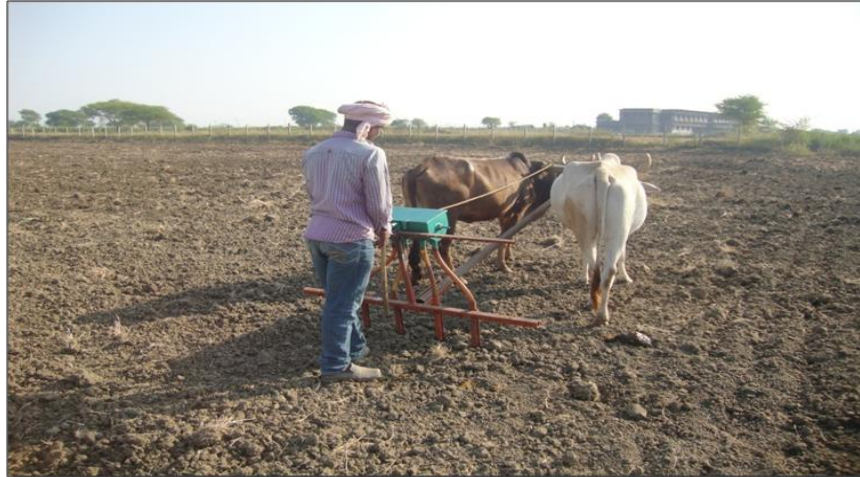
Fig.2 Field performance of modified bhoramdev animal drawn seed drill