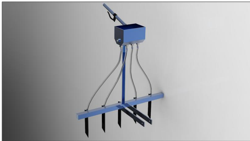
Fig.3 Isometric view of developed modified bhoramdev animal drawn seed drill