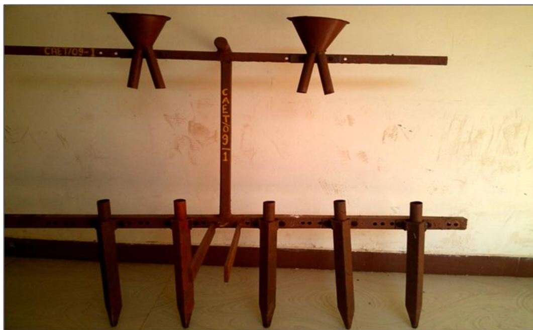
Fig.1 Bhoramdev animal drawn seed drill