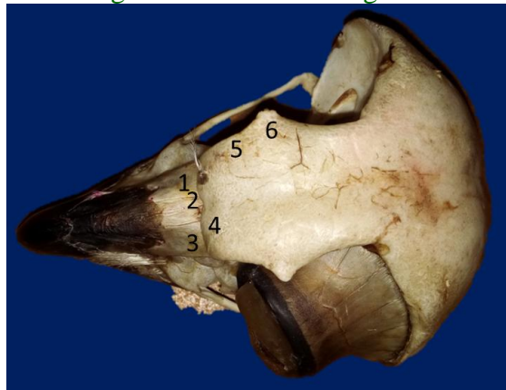
1.Lacrimal 2.Dorsal Lacrimal Process 3.Frontal of Nasal 4. Intermaxillary 5.Maxillary 6.Naso Frontal Hinge