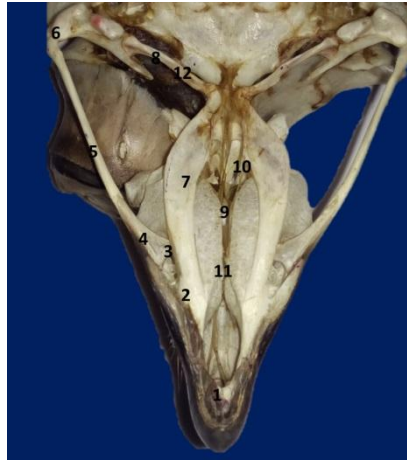
Fig 3: Photograph Showing the ventral view Of Great Indian Horned Owl Skull