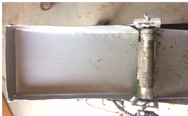
Plate No.4 Feeding Trough