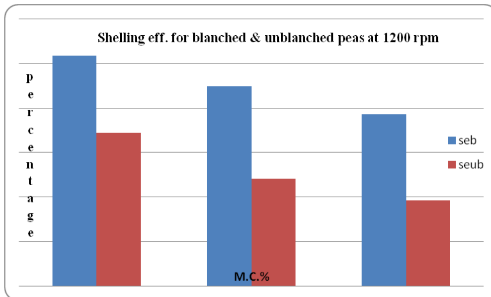
Graph.1 Shelling efficiency graph for blanched &Unblanched peas at 1200 rpm