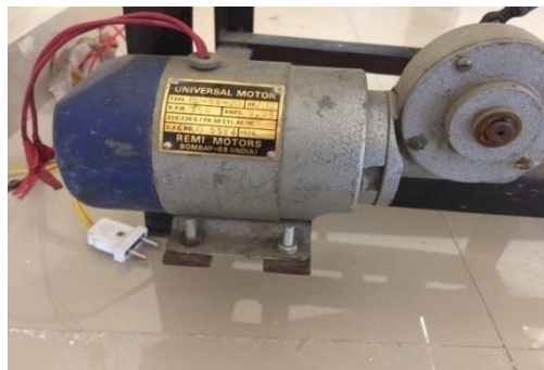
Plate No. 3 single phase A.C electric motor

Type- single phase A.C electric motor Speed - 1500rpm Power generation - 1/12 hp