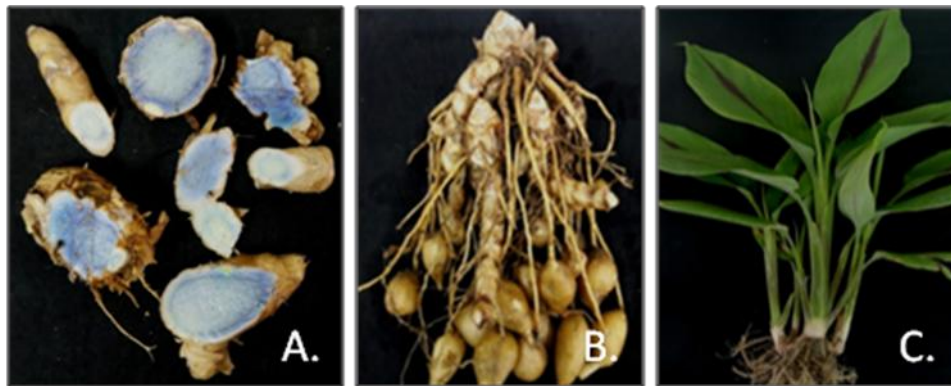
Fig.1(A) Characteristic Bluish colour of Curcuma caesia rhizome. (B) . Mature rhizome and (C) . Full grown plants of C. caesia .

Presently this species is said to be under threat of extinction since natural habitat is being destroyed widely through several human activities like industrialization, urbanization etc. Hence it is necessary to take measures for conservation and multiplication of this unique species. The present study focuses on development of an effective in vitro micro propagation method for C. caesia using rhizome bud as explants.