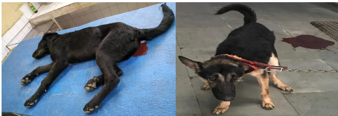
Figure.2 & 3 CPV infected dogs showing haemorrhagic diarrhoea, dehydration and depression.

Non-significant higher mean levels of serum creatinine were observed in CPV positive dogs than control group at day 0 of therapy. Non-significant decrease was observed in BUN and creatinine values in CPV positive dogs on day 3 and 5 of treatment.