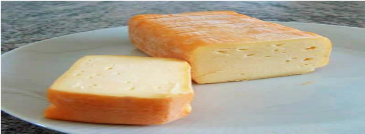
Fig.8 Gouda cheese