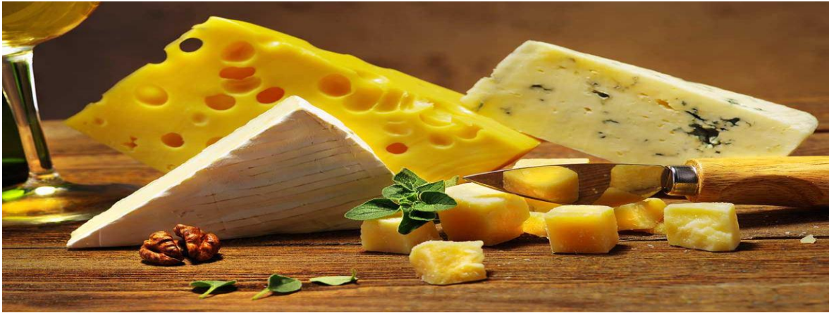
Fig.2 Swiss cheese