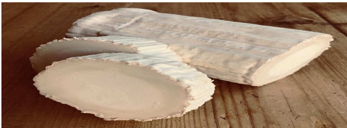
Fig.11 Monterey jack cheese