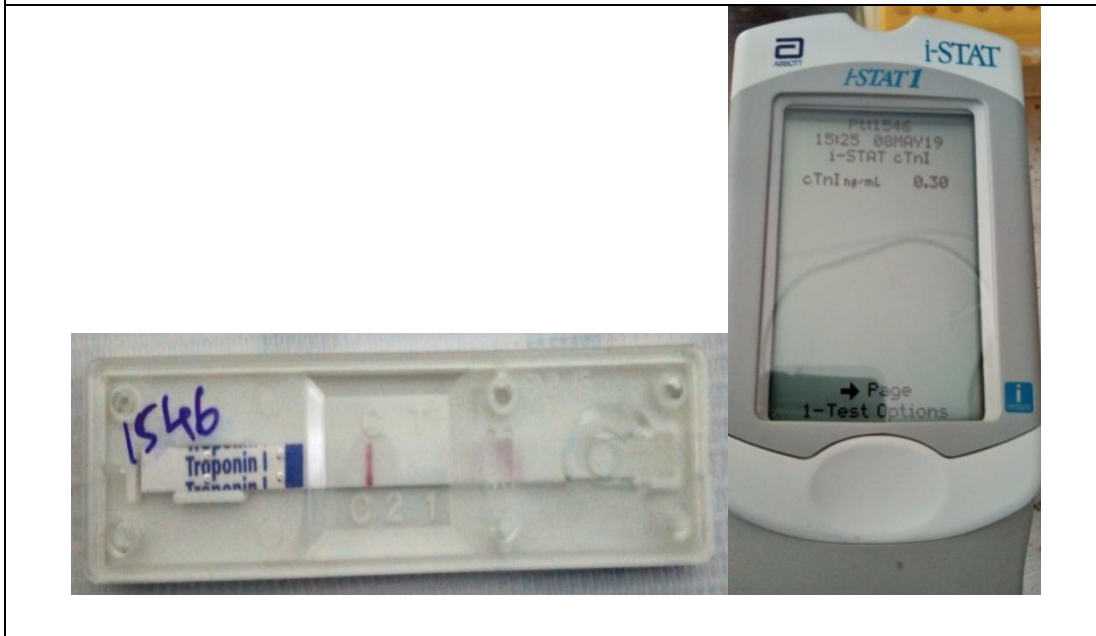
Fig.1 The negative result in reading window of cTn-I immunochromatographic test kit and positive result in iSTAT immune assay kit of same cow that affected with TRP

The values are presented Mean ± Standard Error. BUN – Blood Urea Nitrogen, ; CK-MB - CK-Myocardial band; ALT – Alkaline Phosphatase, AST - Aspartate aminotransferase; LDH - Lactate dehydrogenase, Ca – Calcium, P – Phosphorus. CTnI – Cardiac troponin I. * Significant at p < 0.05. ** Significant at p < 0.01.