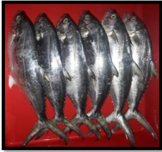
Indo-pacific king mackerel