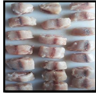
Preparation of chunks