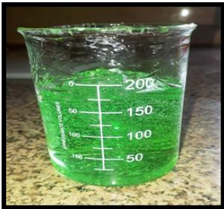
Fresh Aelo vera gel