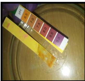
Measurement of pH