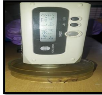
Measurement of color