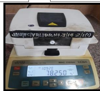
Measurement of moisture