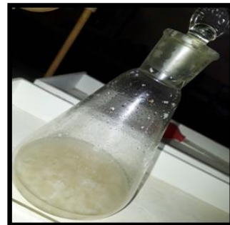
Measurement of PV