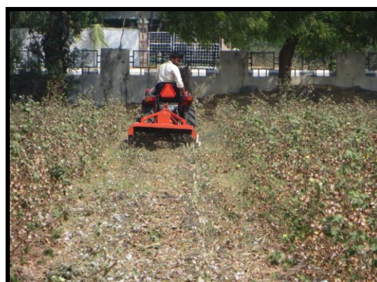
Fig.3 Performance evaluation of small tractor operated roto-slasher in cotton stubbles