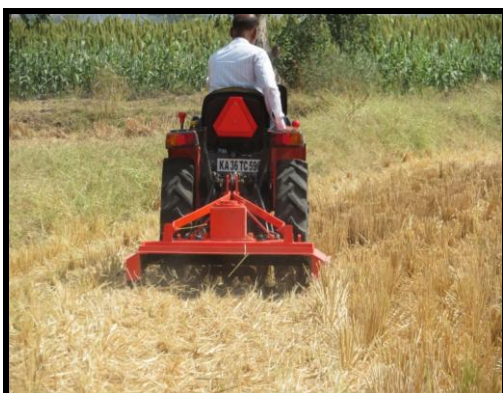
Fig.2 Performance evaluation of small tractor operated roto-slasher in paddy stubbles