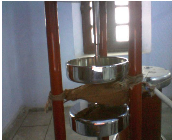
Fig.6 final stage model