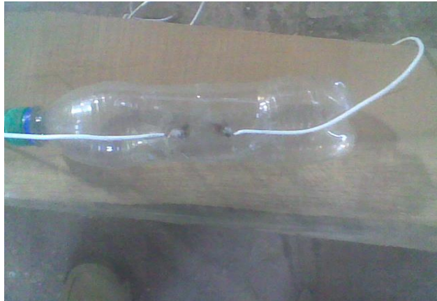
Fig.5 sample under test in high voltage generator